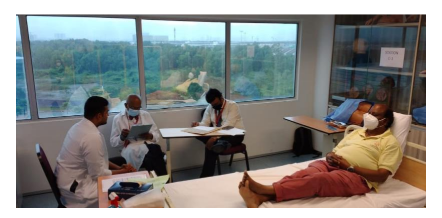
Conduct of i-OSCE in Clinical Skills Lab, SPC, MAHSA University