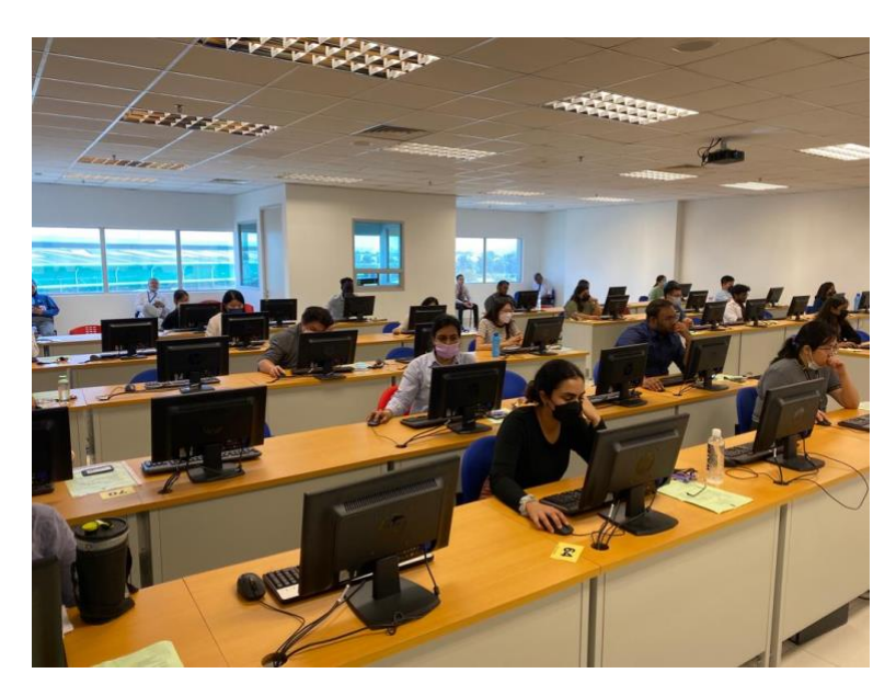
Conduct of Theory Exams via Learning Management System (LMS)

The academic and administrative staffs of School of Medicine and the IT team played significant roles in ensuring the smooth conduct of all our professional examinations. All three professional exams were conducted successfully with positive feedback from all external examiners. Their suggestions were taken into considerations for improvement of future exams.