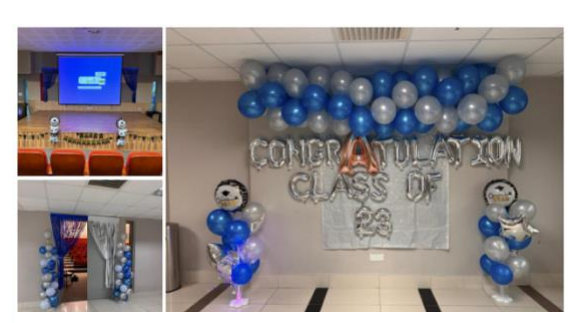
The stage, photo booth and hall entrance were all decorated to greet the class of 2023 graduates. Clockwise from top-left

The Faculty of Medicine (FOM) homecoming event in 2023 was organised on the 1<sup>st</sup> of November 2023 at the auditorium, Level 9, Empathy Building, MAHSA University, from 9.00 am to 11.00 am.